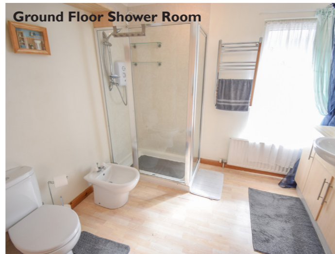
Ground Floor Shower Room